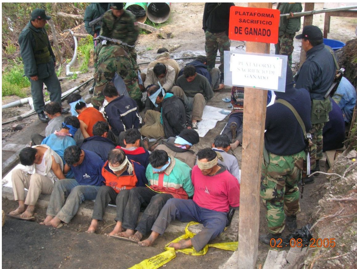
Photo 2: Detained and tortured protesters at the mine Majaz in Plura in 2005

fuels. 10 In only around half of these disputes had the government instigated a process of dialogue. 11