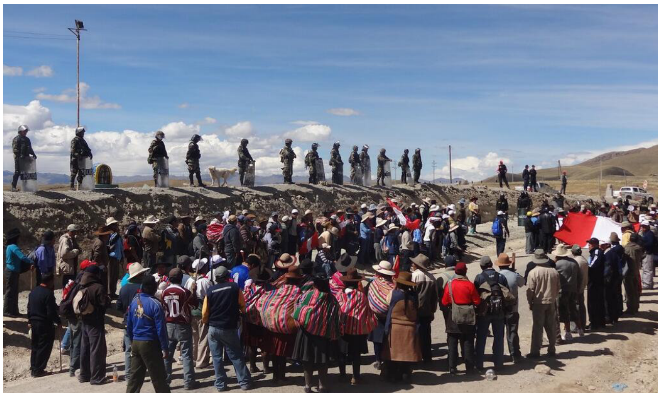
Photo 4: Protests against Xstrata Tintaya mine on 24 Mai 2012 in Espinar, Cusco.

According to the Office of the Peruvian Ombudsman the people of Espinar are anxious to obtain the mining corporation's support for socioeconomic development. 50 The parties have begun discussions and at the end of August 2013 a new agreement was signed between Xstrata and the local people. Among other things this agreement includes necessary measures for the region's sustainable development, an environmental action plan, proposals for regional investment by the corporation and ongoing monitoring of the health effects on local people of heavy metals in their blood and urine. 51 Derechos Humanos Sin Fronteras considers that a considerable amount of work has still to be done before the human rights of people in Espinar are guaranteed, because the discussions have so far failed to resolve all the causes of conflict in Espinar and social tensions remain. 52 For this reason the Office of the Ombudsman has issued a warning to Tintaya. Various local groups and organisations in Espinar have expressed concern over the social and environmental impact of the installations linking Xstrata's mines at Las Bambas, Tintaya and Antapaccay. 53