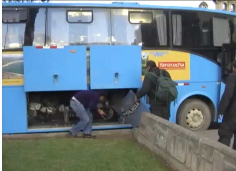
Photo 3: Yanacocha bus used to transport police officers